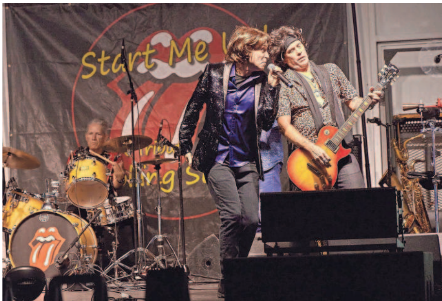
The Rolling Stones tribute band Start Me Up! will perform Saturday, June 17 at Abacoa Amphitheater in Jupiter.